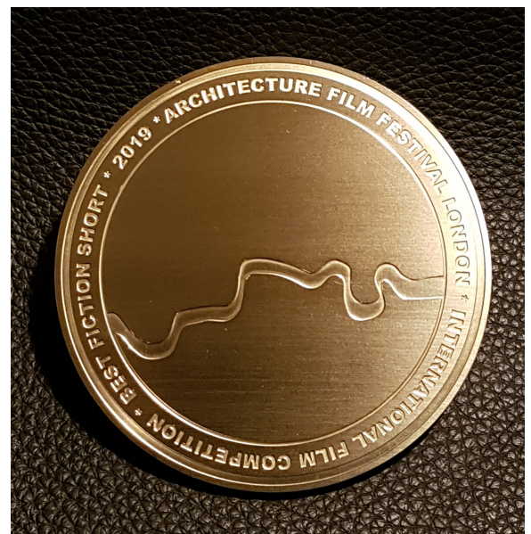
Architecture Film Festival 2019 Award Piece - Best Fiction Film Category Award Shown

London, UK, 01.02.2021 Architecture Film Festival London